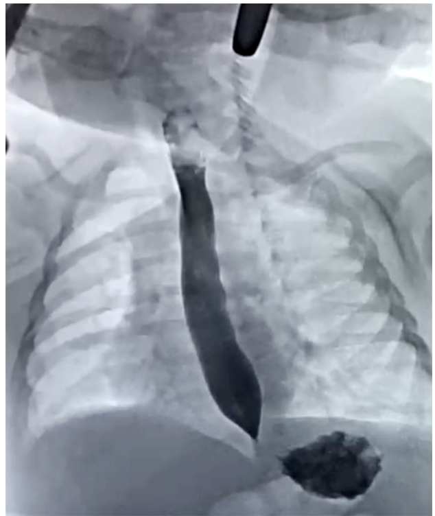
Figure 2. Contrast esophagogram showing lower esophageal dilation with a bird's beak appearance at the esophagogastric junction.

An upper gastrointestinal series was planned for the patient due to the persistence of regurgitation on feeding, which revealed dilatation in the lower two-thirds of the esophagus and a typical bird's beak appearance at the esophagogastric junction (Figure 2). Other causes of obstruction, such as reflux esophagitis, stricture, and diverticulum, were excluded by esophagoscopy. Esophageal manometry could not be performed due to technical inadequacy. Surgery was decided for the patient. Heller myotomy through an open abdominal approach with the antireflux procedure (Dor fundoplication) was performed. The patient was discharged on the postoperative Day 11 with full oral nutrition. The eight-month postoperative follow-up of the patient was uneventful. Weight gain was in the normal percentile range.