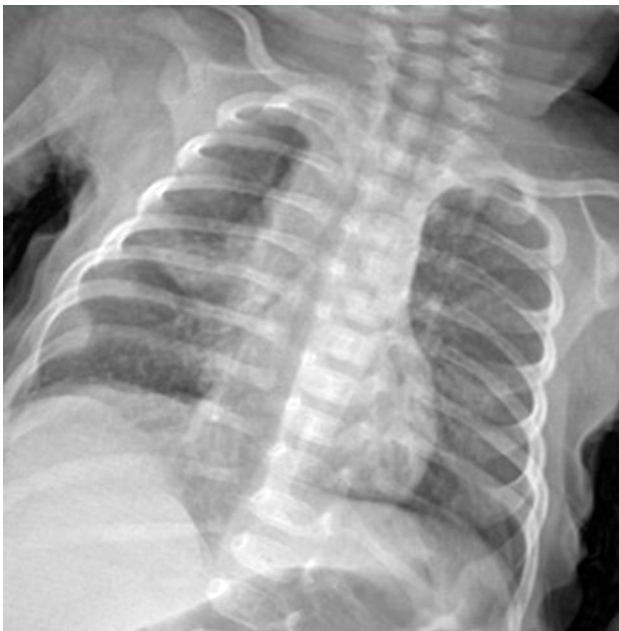
Figure 1. Posteroanterior radiograph revealing right patchy opacities suggesting bronchopneumonia.

(<3 rd percentile) and height of 53 cm (between the third and 10 th percentile). On examination of the respiratory system, bilateral crepitations were detected. Examination of other systems was unremarkable. Routine laboratory investigations were within normal limits. The chest X-ray demonstrated right patchy opacities, suggesting bronchopneumonia (Figure 1). The patient was diagnosed with bronchopneumonia and treated with intravenous antibiotics, salbutamol, and budesonide.