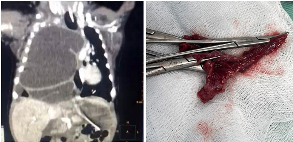
Figure 1. Computed tomography demonstrates the integrity of the diaphragm and a cyst septate image 132×59×41 mm in size and 120 mL in volume, located extrapleurally near the right paravertebral. Intraoperative image of the esophageal duplication cyst; the cyst had a layer of muscle and was connected with an obliterated fistula to the esophagus.