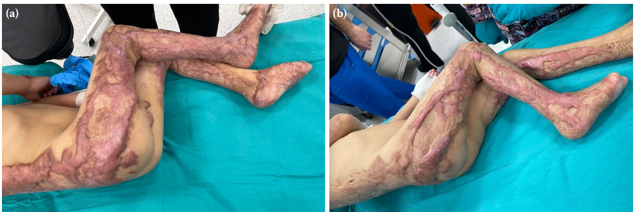
Figure 2. (a) Before laser application; (b) after laser application.

these are performed in the early period before discharge, and some are performed after emergency treatment and the patient is discharged. Early burn wound treatment approaches include dressing, debridement, and graft applications to prevent infection and prevent or minimize scar formation. Despite all efforts in this direction, some patients develop hypertrophic scars. [3,9,10] Patients not receiving emergency or appropriate burn wound treatment also apply to burn outpatient clinics in the late period. Different treatment methods are used for patients with hypertrophic scars after burns. Conservative treatment includes pressure clothing, steroid applications, and silicone applications. [4,5]