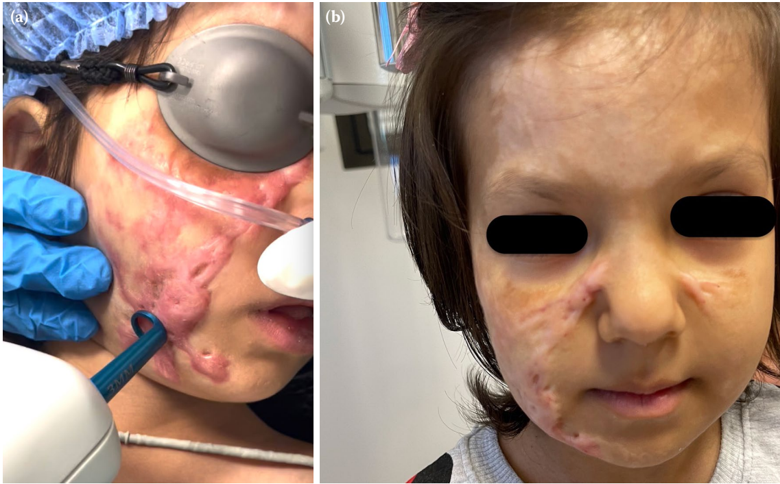
Figure 3. (a) Before laser application; (b) after laser application.