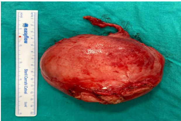
Figure 1. Postoperative image of the mass.